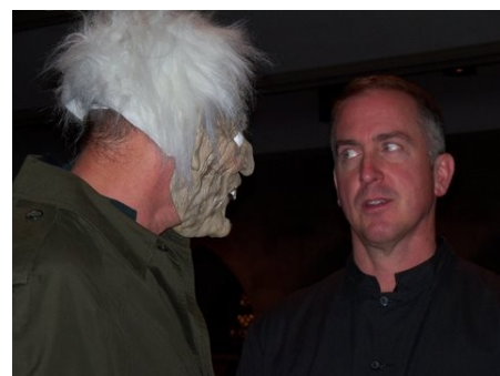
left, with into